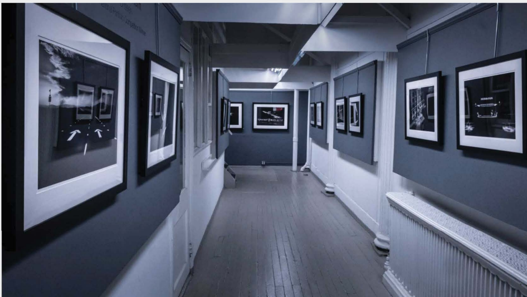
"UNSEEN" by Daniel Sackheim, installation view at Soho Photo Gallery, New York, August 9 – September 9, 2023.

The exhibition veers from the conventional, trading the city's familiar sunlit glow for the shadowy underbelly often hidden from the public eye. Sackheim, with his director's eye, transforms everyday patterns and behaviors into dramatic vignettes, each frame hinting at a story waiting to unfold.